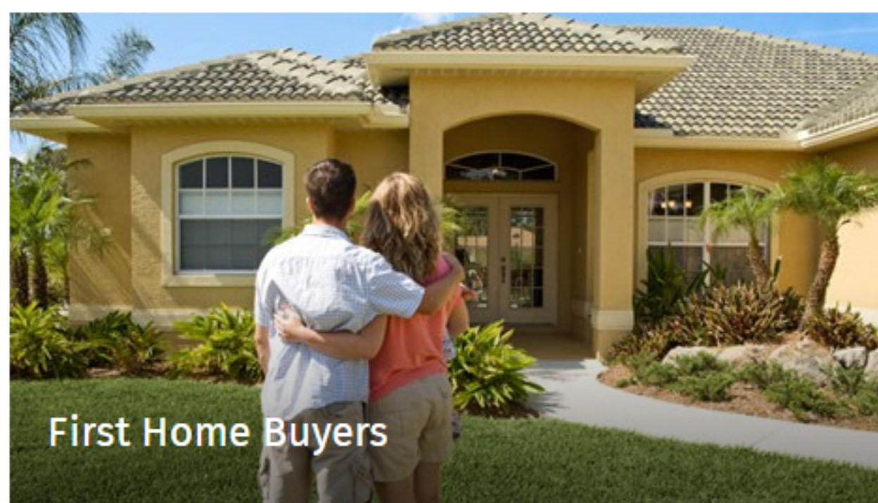
First Home Buyers